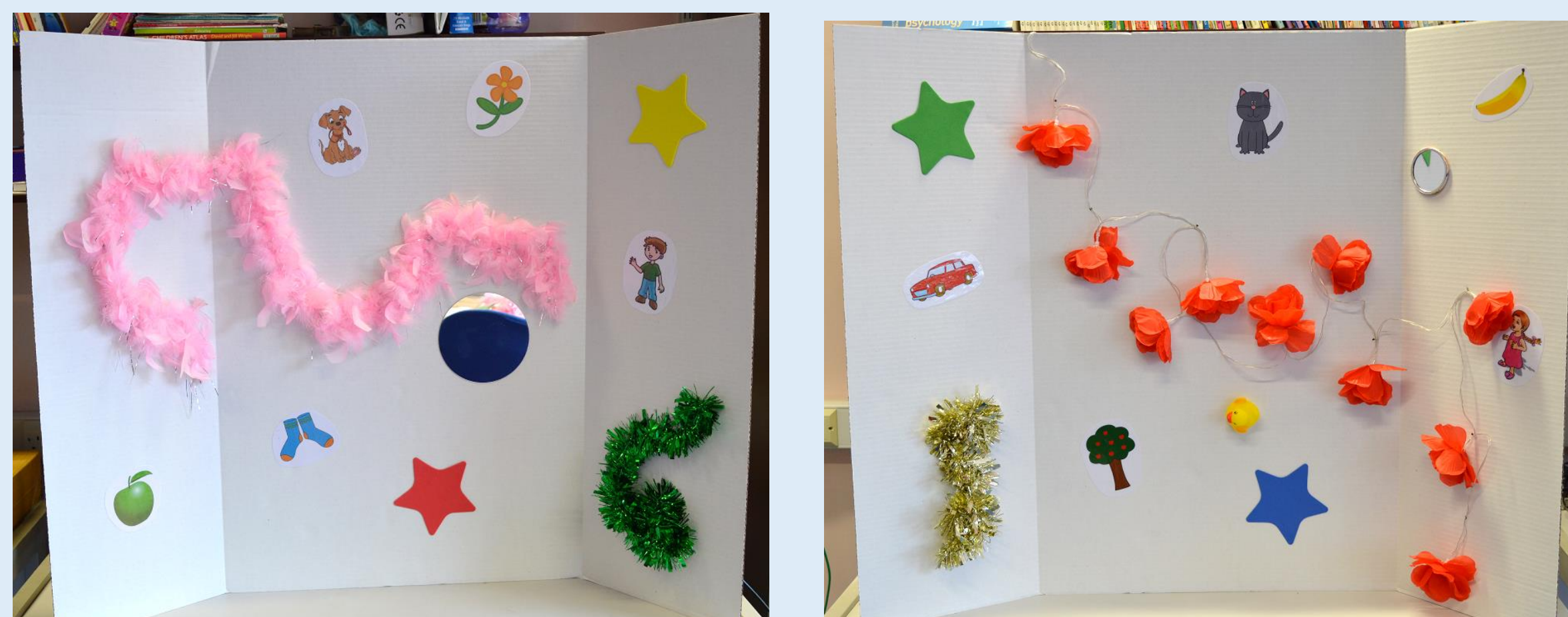
Figure 1. Display boards for task 1.