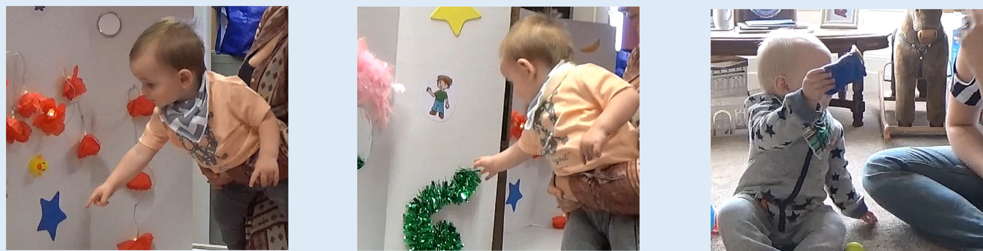
Figure 2. Point, reach and object extension gestures.